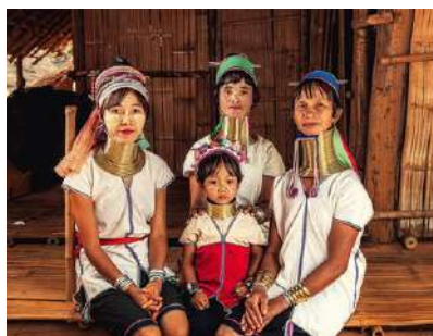
Karen Long Neck Village