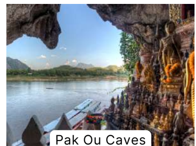
Pak Ou Caves