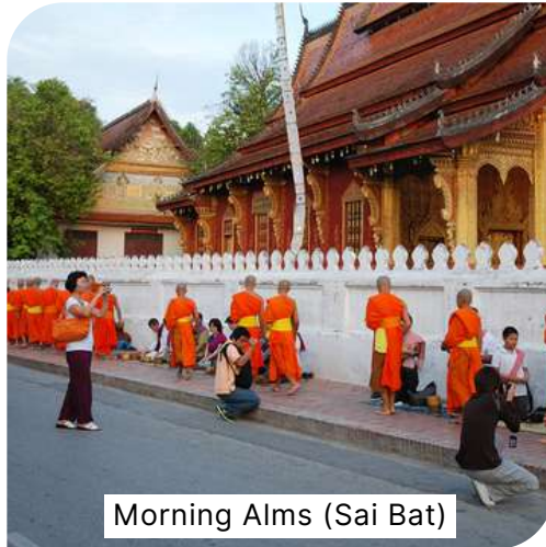
Morning Alms (Sai Bat)