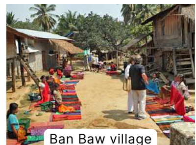
Ban Baw village