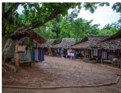
Karen Long Neck Village

Suggestion Flight: PG223 BKKCNX 09:55 11:15 (Airfare excluded on our price)