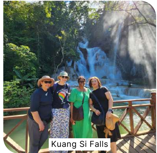
Kuang Si Falls

After breakfast at the hotel, we ascend the 329 steps to the top of Phousi Hill for a panoramic view of the city and the Mekong River. Then transfer directly to the beautiful Kuang Si , which is the biggest waterfall in the Luang Prabang area with three tiers leading to a 50-metre drop into spectacular azure pools before flowing downstream. The pools also make great swimming holes and are very popular with both tourists and locals. There is also the chance to walk to the nearby village of Ban Thapene , and explore the hidden waterfalls, which is rarely visited by other tourists.