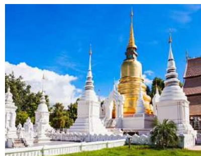
Wat Suan Dok Temple